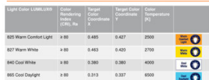
Light colors, color rendering properties and Light Color Coordinates for OSRAM DULUX® - lamps with integrated control gear

Datenname | ORG.D00E | Initial Textverarbeitung | TYPAN.L002